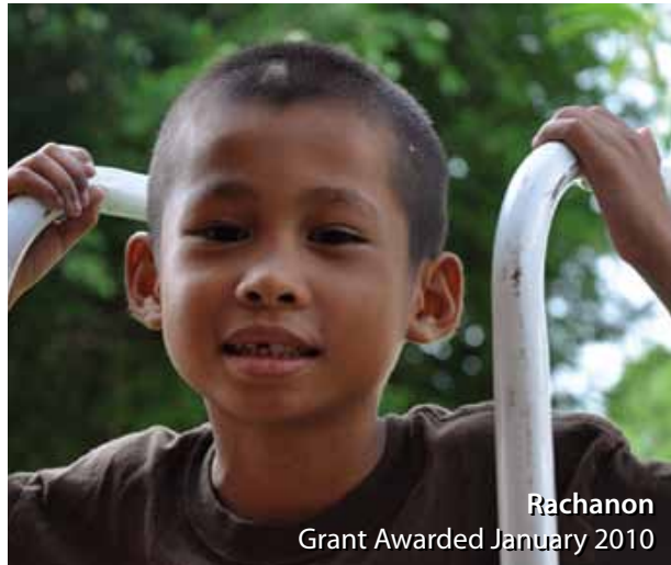
Rachanon Grant Awarded January 2010