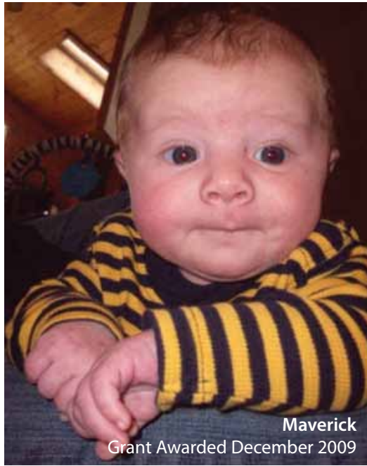
Maverick Grant Awarded December 2009

For the 105 children given the Gift of Adoption this year, life is better – much better.